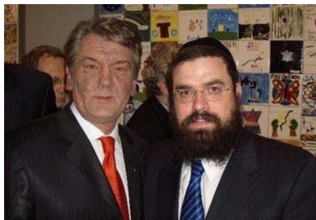
Ukraine - President Viktor Yushenko